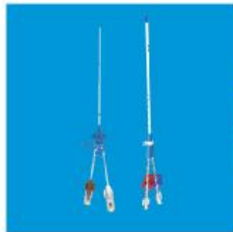
中心静脉导管 & 血液透析导管