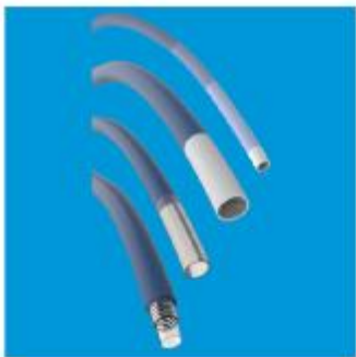
加强型金属编织 & 绕簧管